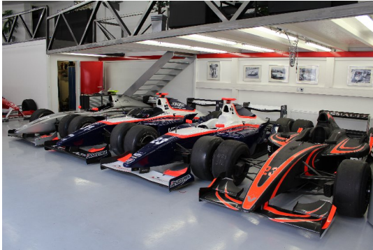
Top Speed's Workshop in Salzburg, Austria