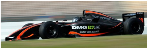
BOSS GP 2010 #23 Gerstl in a WSR3.5