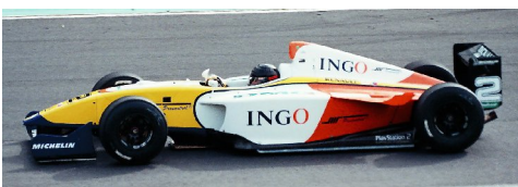
EuroBOSS 2007 #23 Gerstl in WS Nissan 3.0